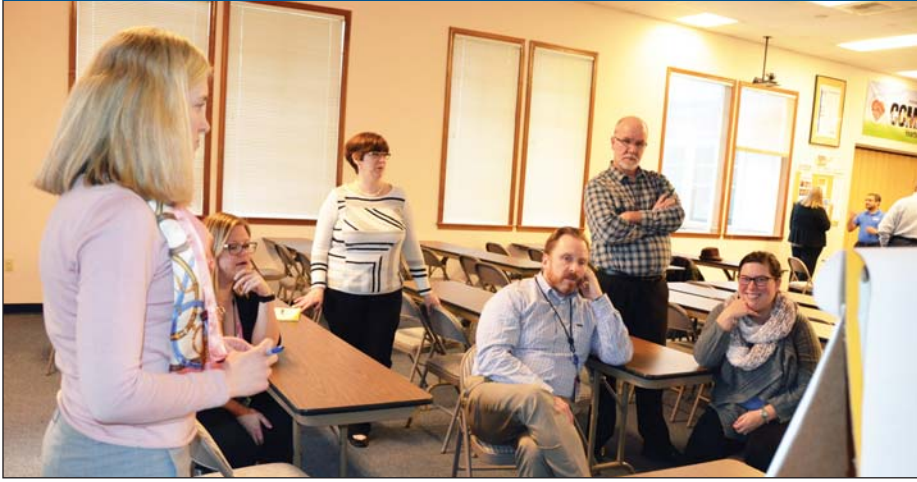
Members of the Everett Roundtable Planning Committee are shown above at the annual offsite to plan for the year ahead. The next meeting of the Everett Roundtable, which brings together Boeing site leaders, Human Resources and Council Reps, is March 8.