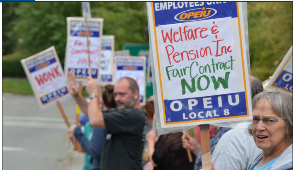
OPEIU Local 8 workers and allies on the picket line outside WPAS, shown here Aug. 30.

4621 E 47th St S, Wichita, KS 67210 M-Th, 8:30 am to 5 pm • Fri, 8 am to 4:30 pm Phone: (316) 682-0262