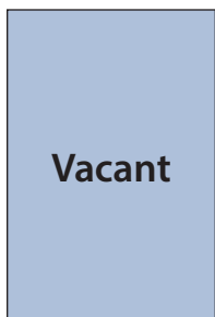
Vacant District RS-10