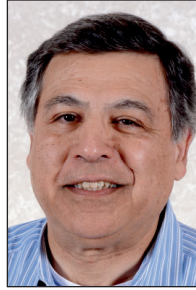
Shah Shahrivar District E-11