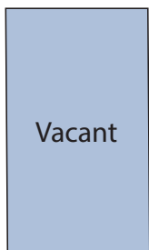
Vacant District E-21