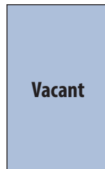
Vacant District D-3