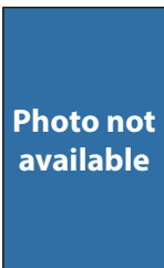
Charles L. Compton District D-1