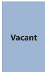
Vacant District D-5