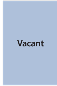
Vacant District E-11