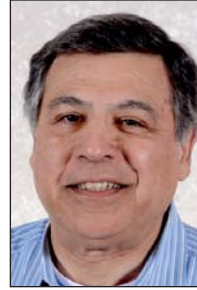
Shah Shahrivar District E-11