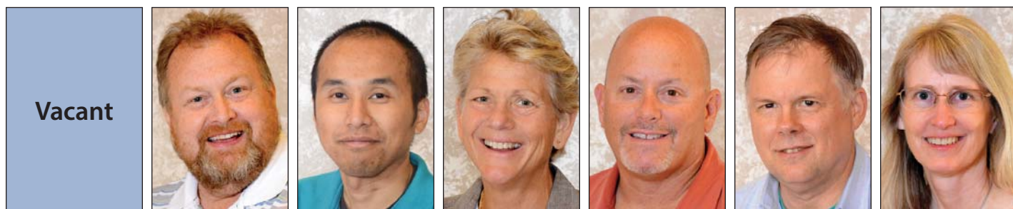
Vacant District R-1