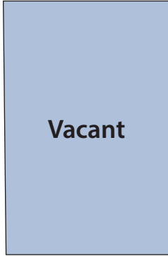
Vacant District K-2