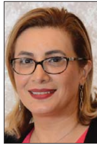
Contested District E-8